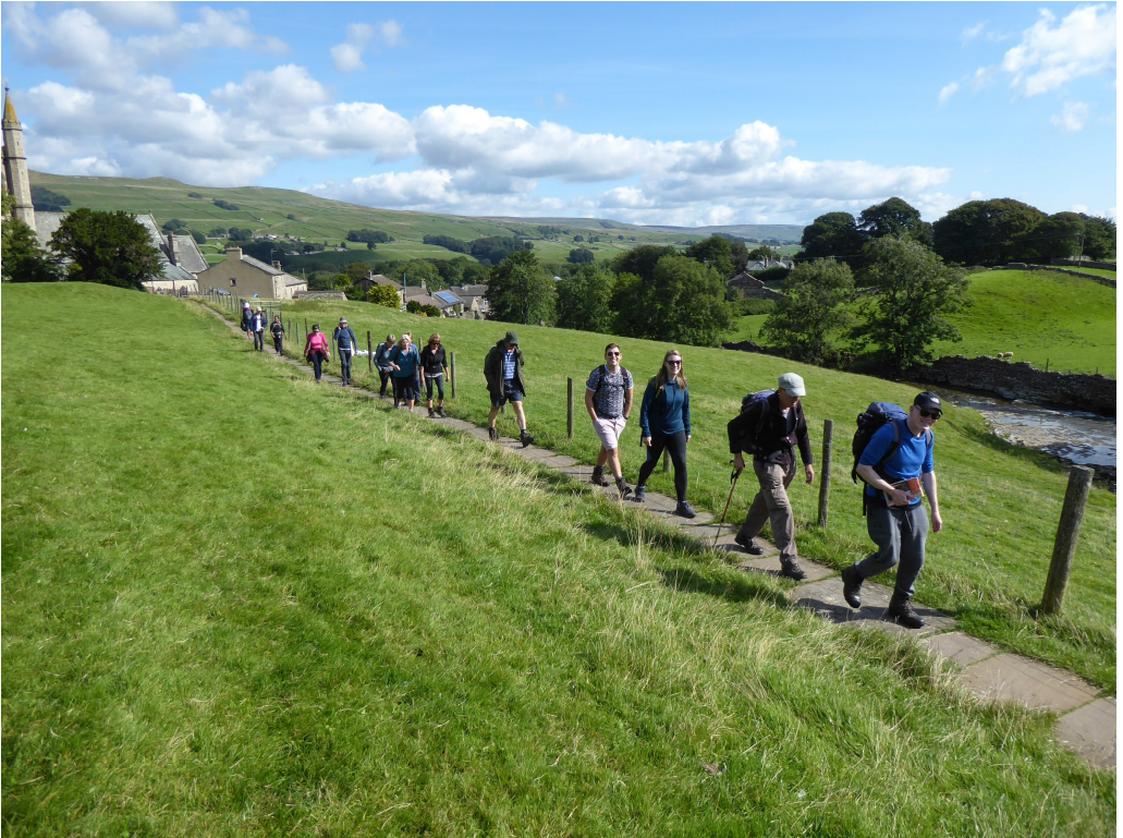
Heading out of Hawes, 08.09.19

Passenger numbers on DalesRail are usually affected by the weather forecast for the day or even in preceding days when potential passengers are planning their weekend activities. Most DalesRail Sundays this year were reasonable with one exception and on August 4th an early evening downpour in Upper Ribblesdale produced a lightning bolt which knocked out the signalling panel at Blea Moor Box just as the DalesRail train was about to enter Blea Moor Tunnel. As a result, the train was delayed for an hour before being allowed to proceed at caution. Otherwise most trains ran to time. The Class 158 units provided were well received by passengers.