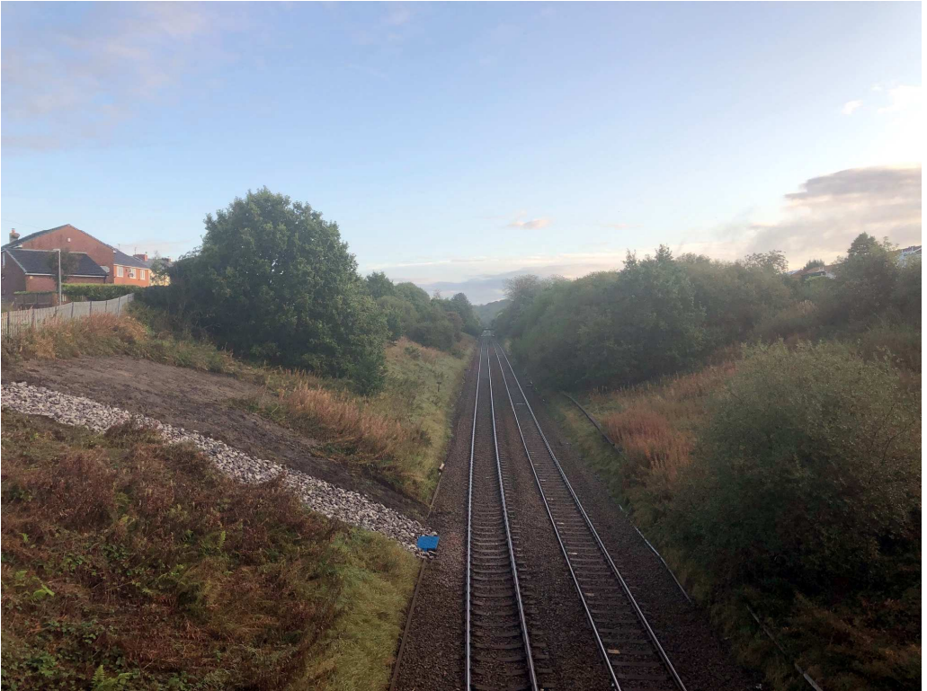
Evidence of the stabilisation work being carried out in Brownhill cutting in a view looking towards Wilpshire.

Network Rail have also recently been carrying out embankment stabilisation and drainage works in the Wilpshire area. A section of the embankment close to the station has been completed and a larger section in Brownhill cutting is shown pictured looking towards Wilpshire.