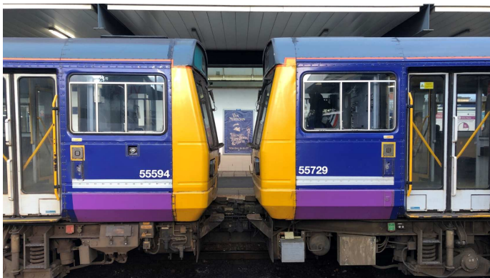
Pacers 142003 & 142029 stand at Blackburn.

Northern has issued a response following criticism over the retention of a small number of Pacers into early 2020. They said there had been significant delays to the delivery of its new CAF Class 195 diesel and Class 331 electric multiple-units. It expects to have more than 70% of the new units in service by the end of the year, but 11 Class 142 Pacers would have to remain in service 'for a few weeks' into 2020 to maintain capacity south of Manchester and between Blackburn and Rochdale. Nine Class 142s would be used each day, paired with units meeting PRM accessibility standards.