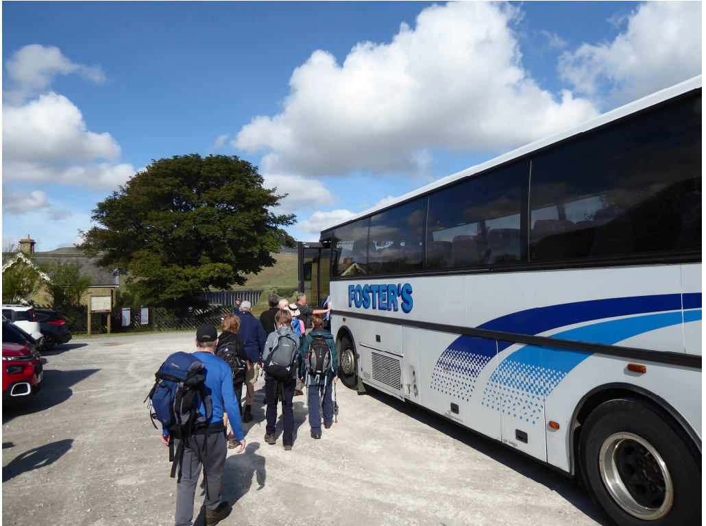
Boarding the coach link to Wensleydale, 08.09.19

After disrupted Dalesrail seasons in 2015, 2016 and 2018, Northern managers promised that the service would run every Sunday this year and, true to their word, it did. Naturally, because of previous unreliability, it took time for confidence in the service to increase but, gradually, many regulars returned and the numbers of day-trippers increased. Almost 2000 passengers used the DalesRail train this year.