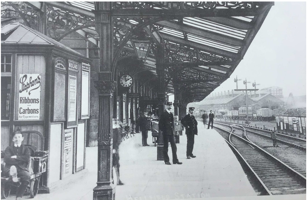
THEN - Staff seem to outnumber passengers and posters advertising all manner of things adorn every bit of wall. The fine Midland engine shed and impressive signal post can be seen in the background.