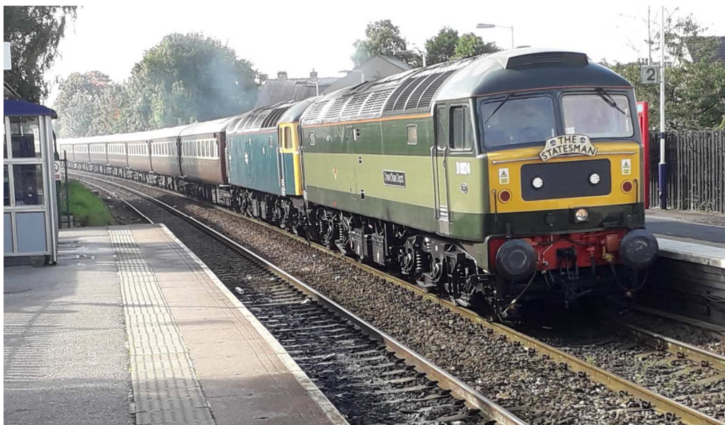
The Statesman Pullman heading north through Clitheroe on Saturday 2 nd November 2019. The two Class 47s were D1924 (Crewe Diesel Depot) and 47641.

Other working and occurrences of interest noted have been 56078/56087 on a cement working on 5 th July, 47746/47854 heading 1Z80 a Carlisle to Euston excursion on 13 th July, 37706/37669 1Z44 Chester to Carlisle 3 rd August, Class 142004/142031 on 2J21 6 th August, 37218/37259 heading a test train 16 th August and Class 56096/56087 6C89 24 th September.