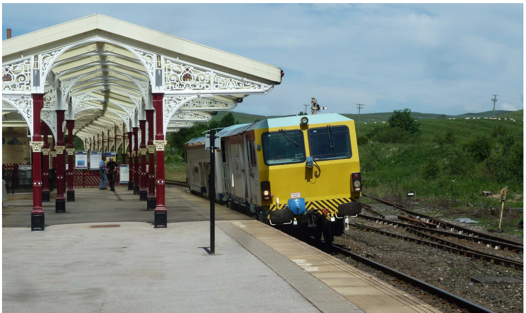
NOW - A track tamper stands at the platform and the cast iron platform canopies have stood the test of time. Hellifield now has no staff and the engine shed is long gone.