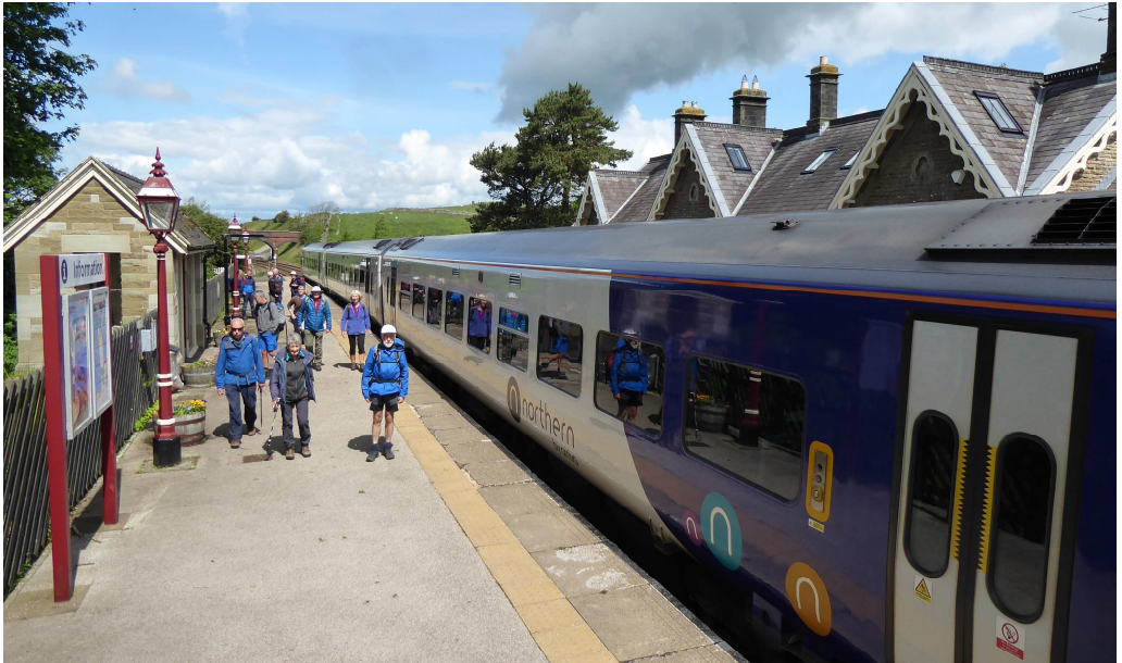
Alighting from the DalesRail service at Kirkby Stephen, 09.0.06