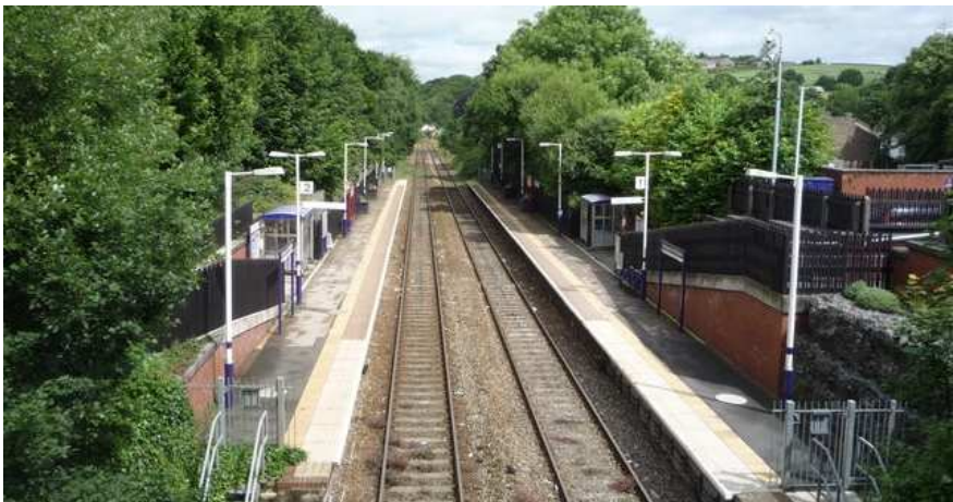
Ramsgreave & Wilpshire station.