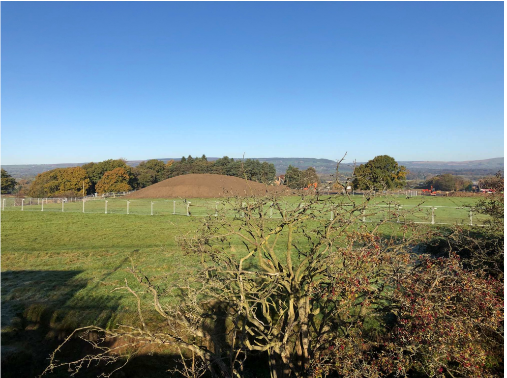
Work starts on Northcote Park to the north of Langho station.